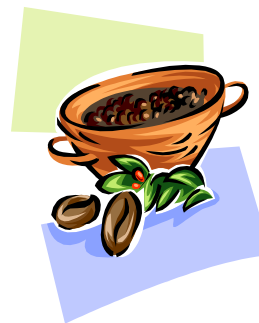
Are you showing the fruit of God's Plan for you in life?